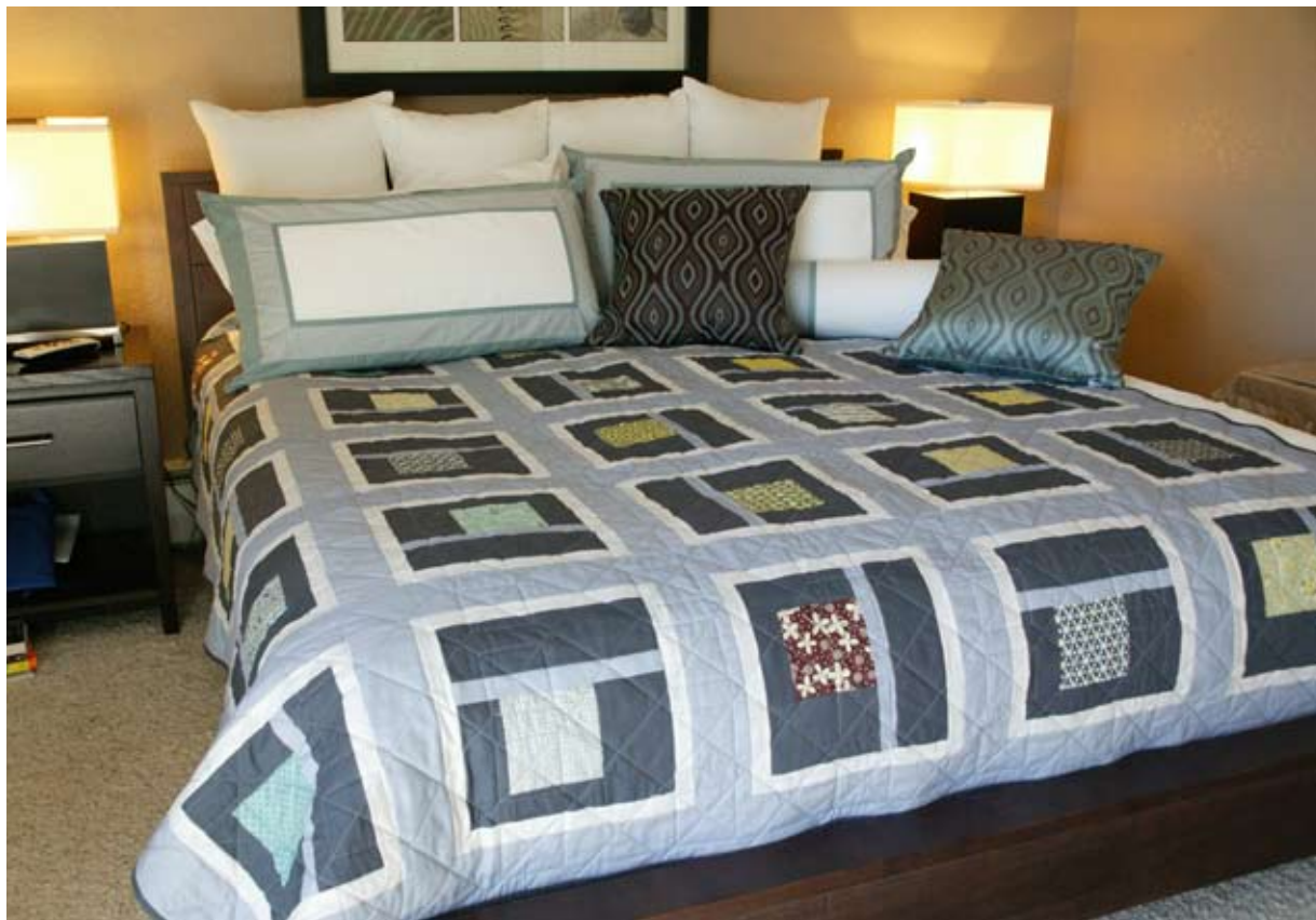
This quilt, featured in the April/May 2011 issue of McCall's Quick Quilts , is cool in tone. Our alternate colorway uses warmer shades.