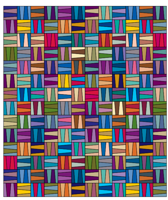
Queen Size Quilt Top Assembly Diagram