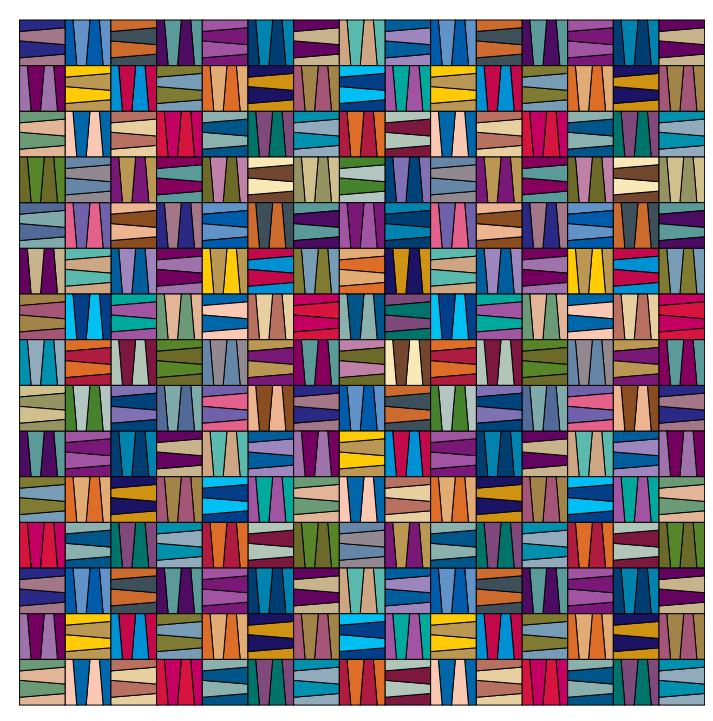
King Size Quilt Top Assembly Diagram