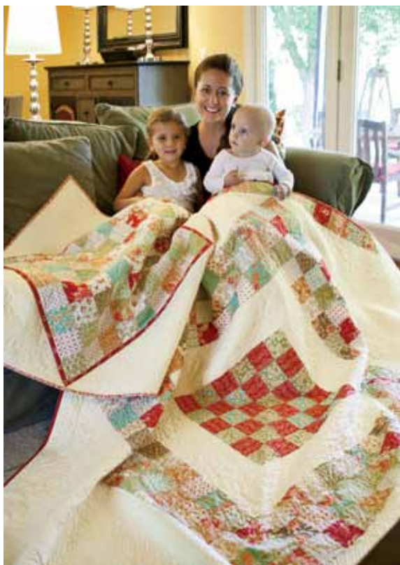
The larger (71" x 77 1/4") Family Tradition quilt is patterned in the November/December 2012 issue of McCall's Quilting.