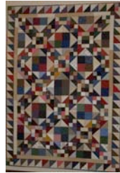
Chattanooga Choo Choo – July/August 2003