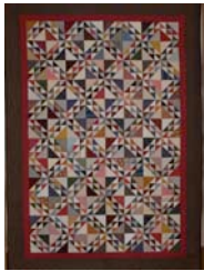
Corn and Beans – July/August 2005