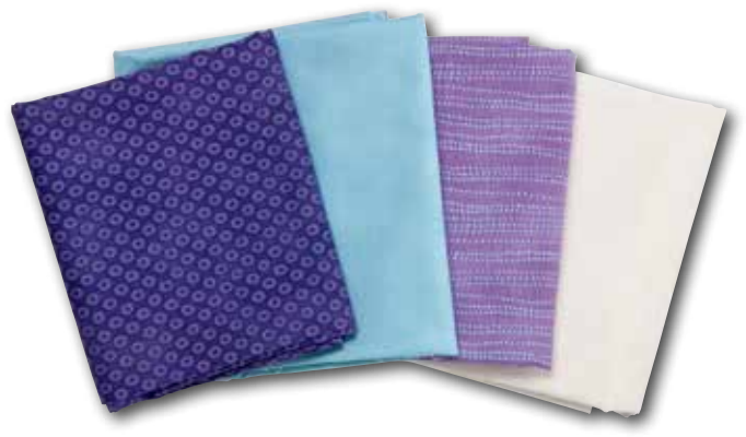
Gemstones uses Artisan Spirit Good Vibrations Mysteria and Toscana by Northcott for a rich majestic quilt.