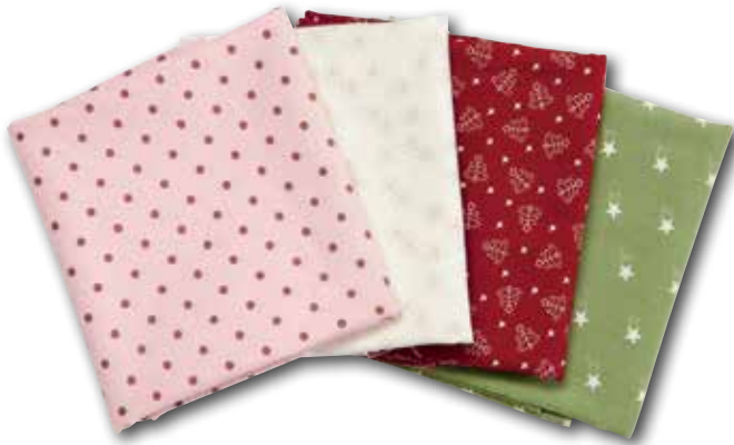
Holiday Magic uses Mistletoe Lane by Moda Fabrics for a festive holiday quilt.

Join us in the May/June '15 issue as more clues to the mystery are revealed. ■