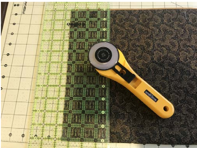
Ruler lined up to cut a 3 ½" strip x WOF (Width of Fabric).

Cut 40 squares 3 ½" x 3 ½" from the 4 strips of dark fabric.