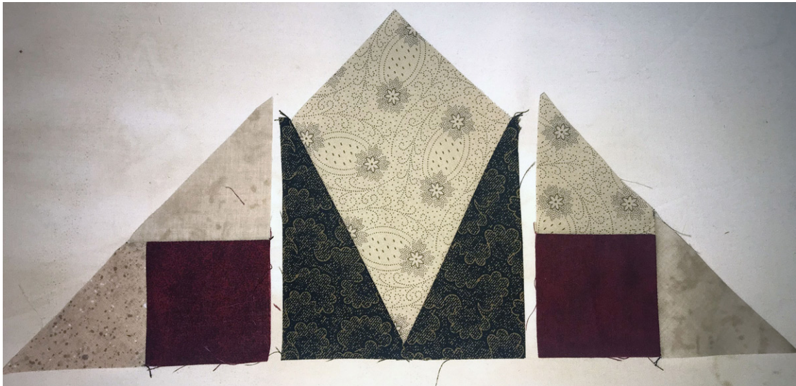
Kite Triangle Unit

Using all of the triangles from Clue #3 and 20 Kites from Clue #4, sew a triangle to each side of a Kite to make a Kite Triangle Unit as shown below. Make 20 Kite Triangle Units.