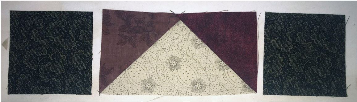
Flying Geese Square Unit

Join the 3½" squares and 20 of the Flying Geese you made in Clue #2 to make 20 Flying Geese Square Units.