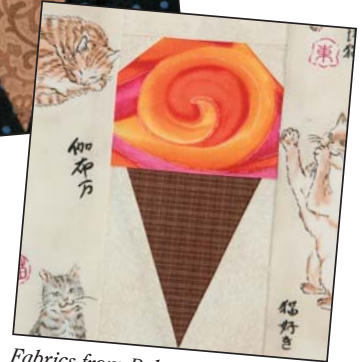
Fabrics from Robert Kaufman.