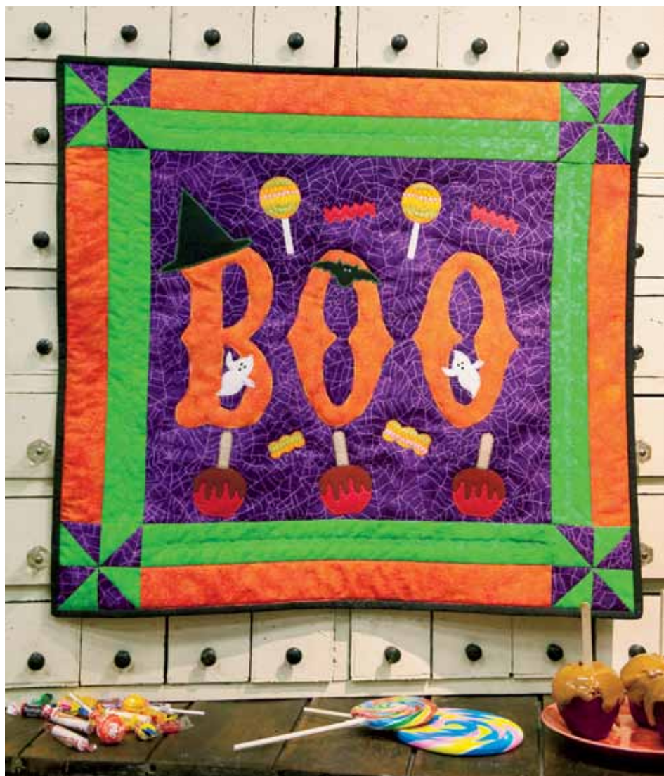
Photographed at Old Glory Antiques; 303-798-4212; oldgloryantiquesinc.com .