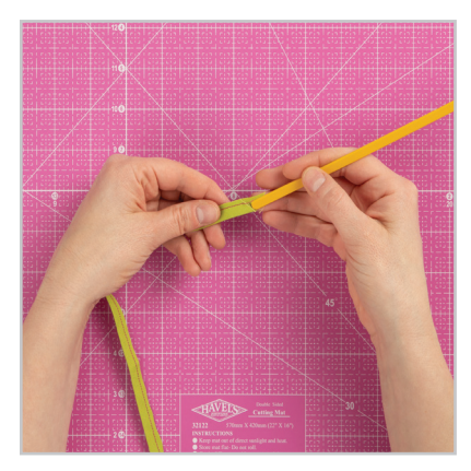
3. Insert <sup>1</sup>/<sub>4</sub>"-wide bias bar into sewn strip.

2. Trim seam allowance to \frac{1}{8} ".