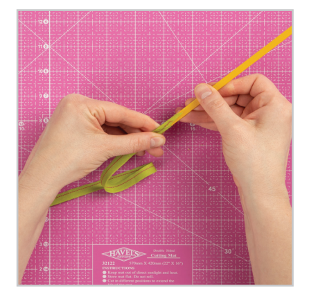
4. Adjust strip so seam is centered on bar.