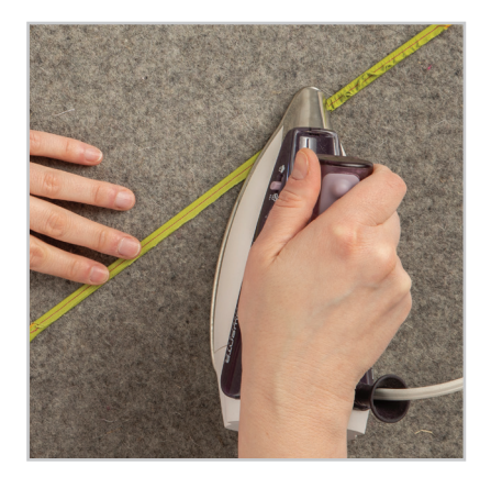
5. Spray with starch and press seam allowance to one side of strip.