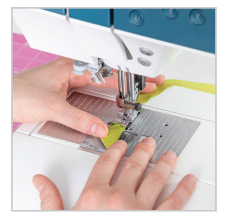
1. For ¼"-wide finished strips, cut 1¼"-wide bias strips. Fold strips in half lengthwise with wrong sides facing, and machine-stitch ¼" from folded edge.

Bias pressing bars, made of metal or heat-resistant plastic, simplify the preparation of consistent-width bias strips.